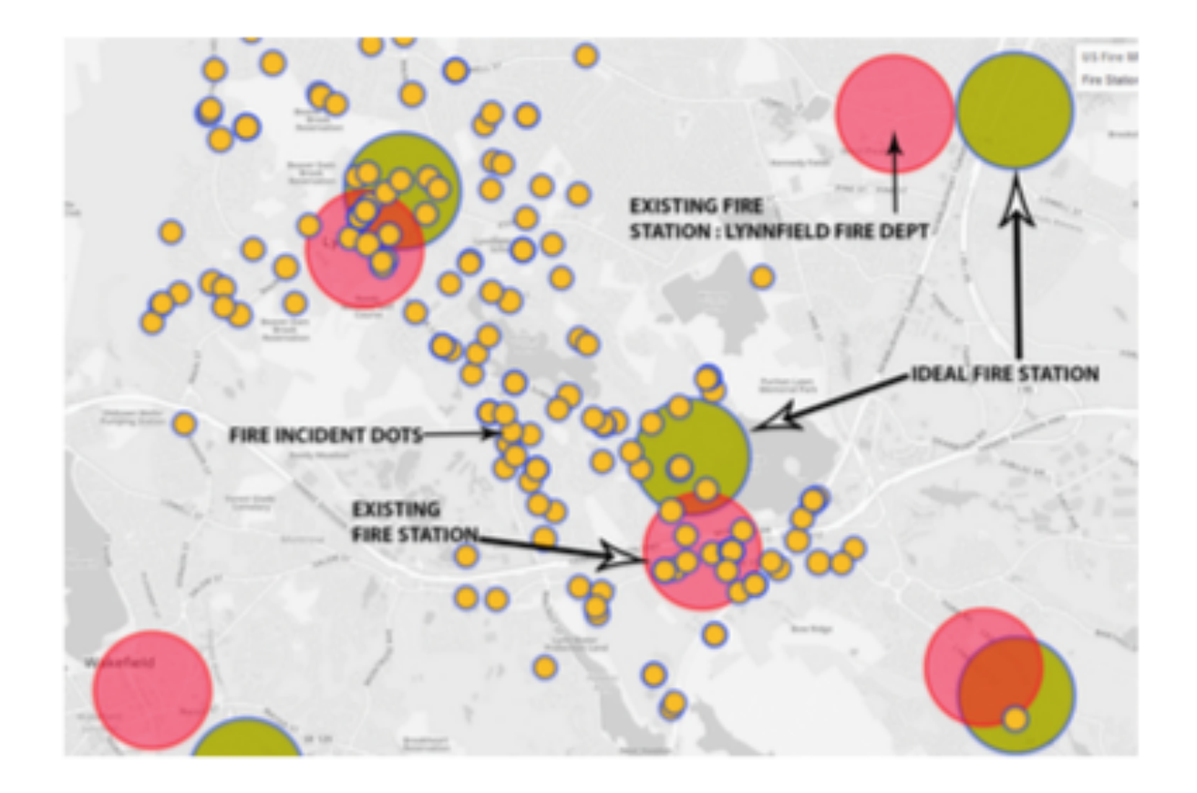
Figure 1: Screenshot of ISPARK showing actual (pink) and predicted (green) fire station locations a Maine determined by our approach, using coordiates with actual driving distances from fire stations o actual fire incidents. Fire incidents are shown as small vellow dots. ISPARK reduces the average