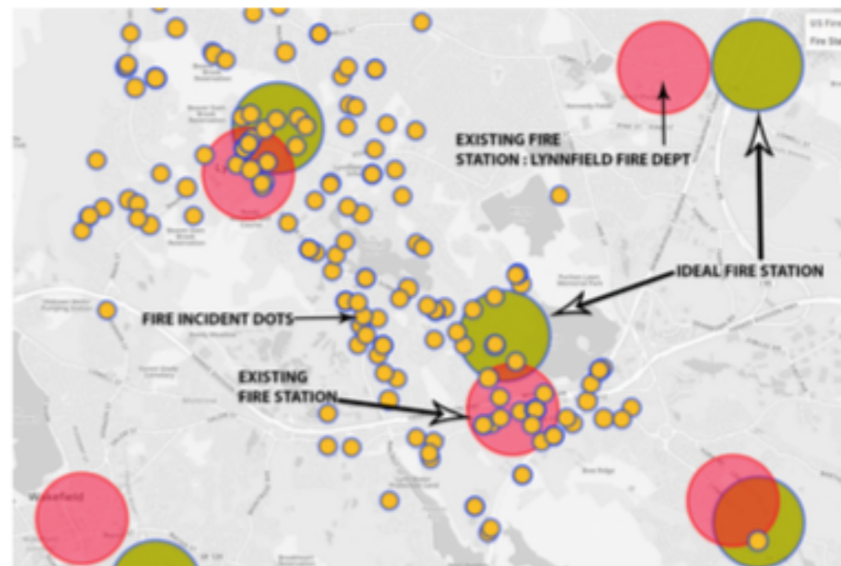
Figure 1: Screenshot of ISPARK showing actual (pink) and predicted (green) fire station locations in Maine determined by our approach, using coordinates with actual driving distances from fire stations to actual fire incidents. Fire incidents are shown as small yellow dots. ISPARK reduces the average

In support of helping to reduce the response time of fire-fighters, and thus deaths, injuries, and property loss due to fires, we introduce ISPARK. The ISPARK system determines where fire stations should be located, analyzes the primary causes of fires, the existing infrastructure, and response times, by using visualizations which show the GIS mapping of fire stations on a dashboard. Incidents and response times are shown as additional layers, with clustering of fire incidents to determine predicted fire station locations, forecasting of fire incidents using regression, causal, infrastructure, and personnel analysis, creating an interactive, multi-faceted method for locating fire stations. A comparison of urban and rural fire incident response times is another dimension of this study. We demonstrate ISPARK's usage and benefits using a publicly available dataset describing 300,000 fire incidents in the states of Massachusetts and Maine. ISPARK is generalizable to other geographic areas